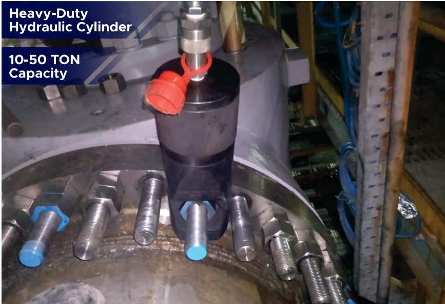
Heavy-Duty Hydraulic Cylinder