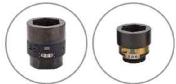
INCLUDED 12K & 18K* SMART SOCKETS**