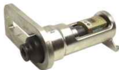
SMALL CALIBRATION SYSTEM