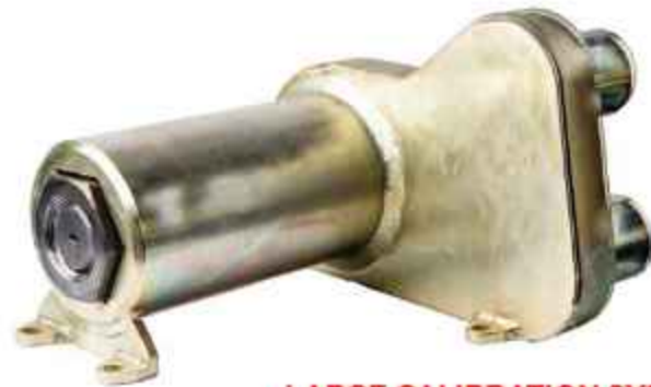
LARGE CALIBRATION SYSTEM