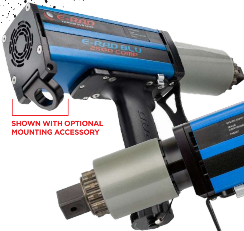
SHOWN WITH OPTIONAL MOUNTING ACCESSORY